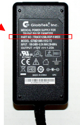
Figure4, External Power Supply device plate

GlobTek, Inc. MEDICAL POWER SUPPLY FOR TRUSAT PULSE OXIMETER PART NO: TR9CE1250LRDP-Y-MED