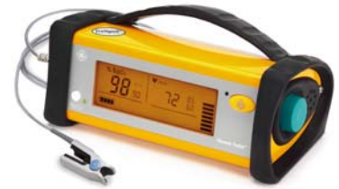
Figure 2, TruSat Oximeter

This action applies to TruSat oximeters with external power supplies sold under the GE or Datex-Ohmeda brand name (figure 2). The reference numbers for the affected TruSat oximeters are listed below. The reference number (REF) can be found printed on a transparent sticker on the bottom of the oximeter.